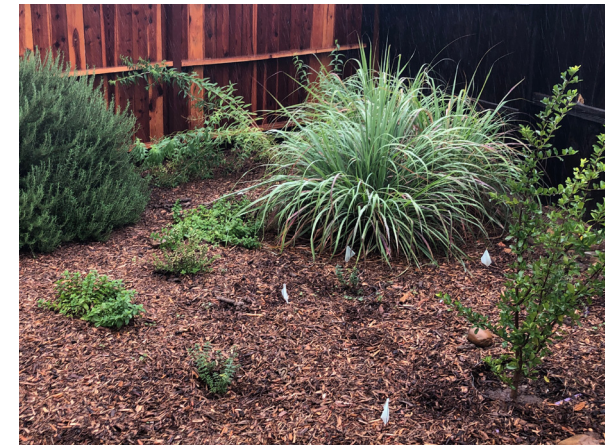
Landscape site grown in with layer #4 (wood chip mulch) atop all layers