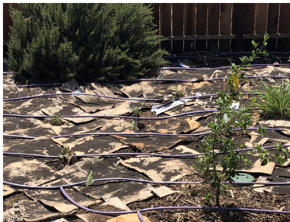
Layer #3 (compost) covering layers #1 and #2