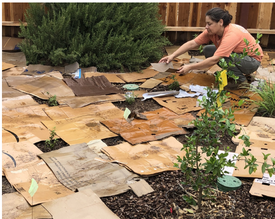
Layer #1 (compost) underneath layer #2 (barrier)